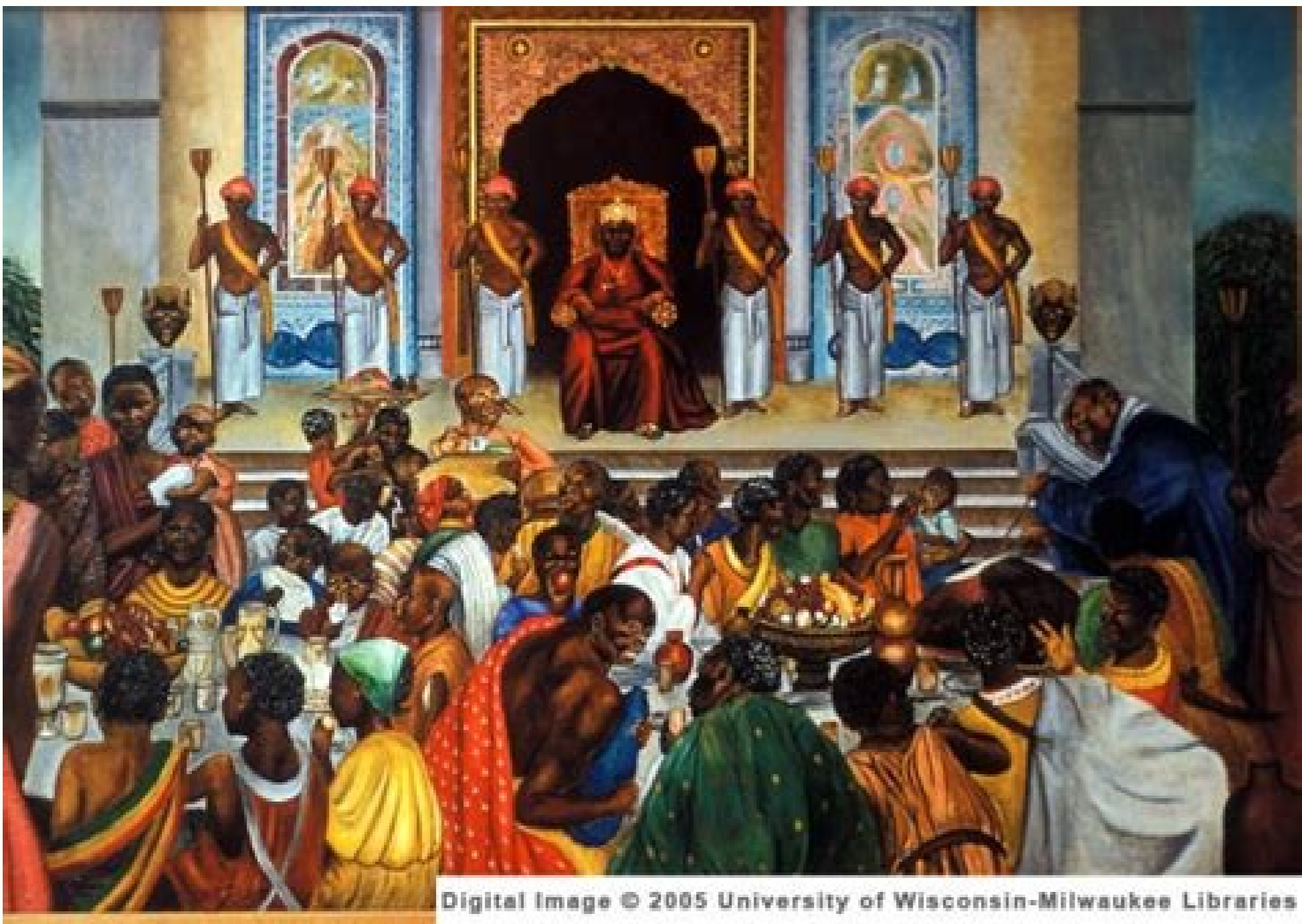
Digital Image © 2005 University of Wisconsin-Milwaukee Libraries